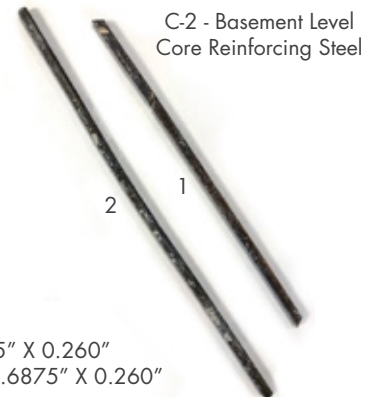
FIGURE 1. The core reinforcing steel samples in the as-received condition.